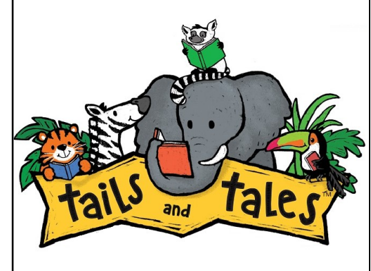
Story Time in a Bag Preschool & Early Elementary Book & Activity Package